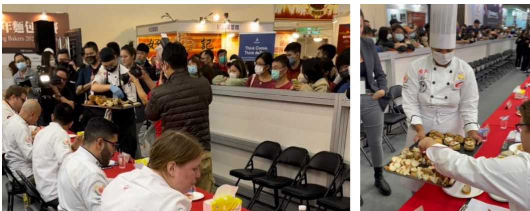
Public jury tasting at 51. Competition 2023 in Taipei (TIBS Exhibition)

After the jury, the remaining products are to be distributed on the tray to the fair visitors in the audience so that they can also convince themselves of the quality. Therefore, there should be enough portions on each tray.