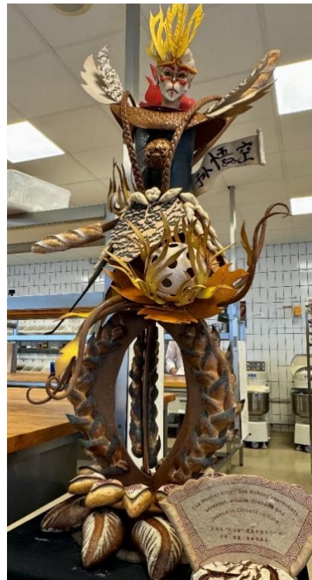
Left picture: The showpiece of the winners 2021 in Lyon, France / Right picture: The showpiece of the Chinese Team 2024 in Reykjavik, Iceland

Free tutorial for showpiece doughs: https://youtu.be/q0QdiFhzmkl Please note that in addition to this special dough, at least 25% fermented dough must also be a fixed component of your showpiece.