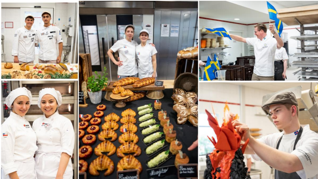
Photos from 50 th competition 2022 in Berlin