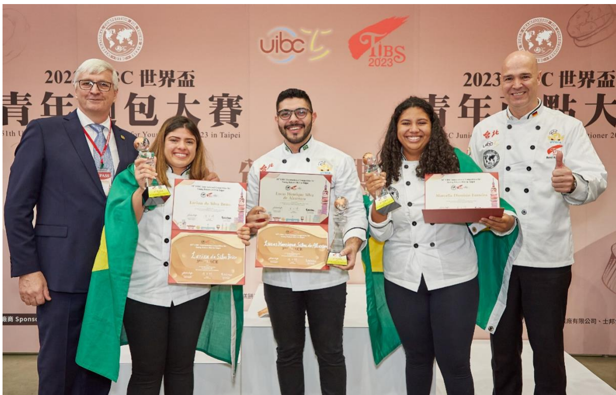
Photo from 51 th competition 2023 in Taipei

* If the organiser provides own professional jackets, headgear and/or aprons with the logos of sponsors or similar, these are obligatory.