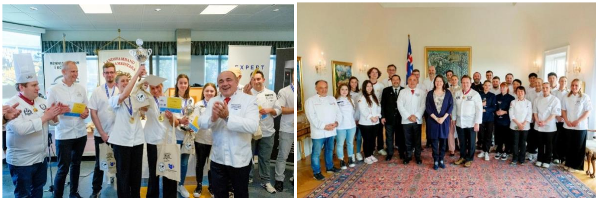
Photos from 52 th competition 2024 in Reykjavik, Iceland. On the left the award ceremony, on the right the reception of the teams in the summer house of the Icelandic President, by the First Lady

The most successful country participating in the competition for the first time will receive the New Country Award , unless the country has already won one of the other awards.