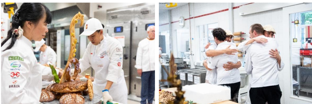
Photos from 50 th competition 2022 in Berlin

The competition time on the day of the competition is 6 hours , including cleaning of the work area and presentation of all products on the presentation tables. No overtime is possible.